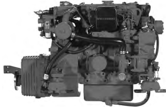
30C Three Marine Diesel Engine

The presence of Westerbeke in over 65 countries around the world provides customers with easy access to parts, service and technical support worldwide. Established in 1937, Westerbeke is committed to providing its customers with quality products and unequalled after sales support.