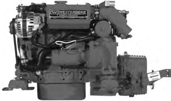
30C Three Marine Diesel Engine