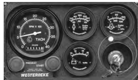
Optional Admiral Panel