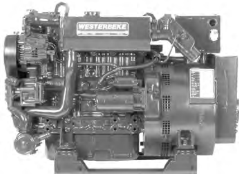
12.5 BTDB Diesel Generator