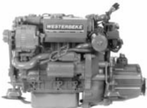
30B Three Diesel Engine