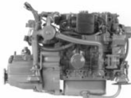
30B Three Diesel Engine