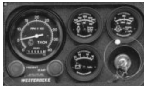
Optional Admiral Panel