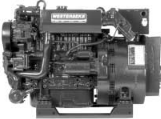
15 BTDC Diesel Generator