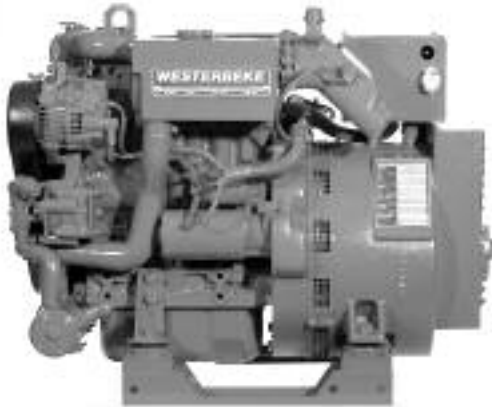
8 BTDA Diesel Generator

A truly “quiet breed” of reliable power..